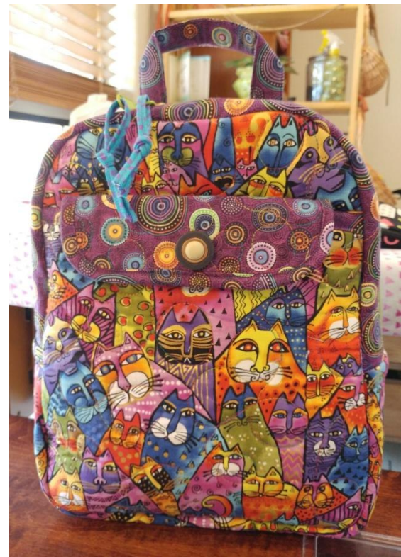
Donna Bracewell backpack