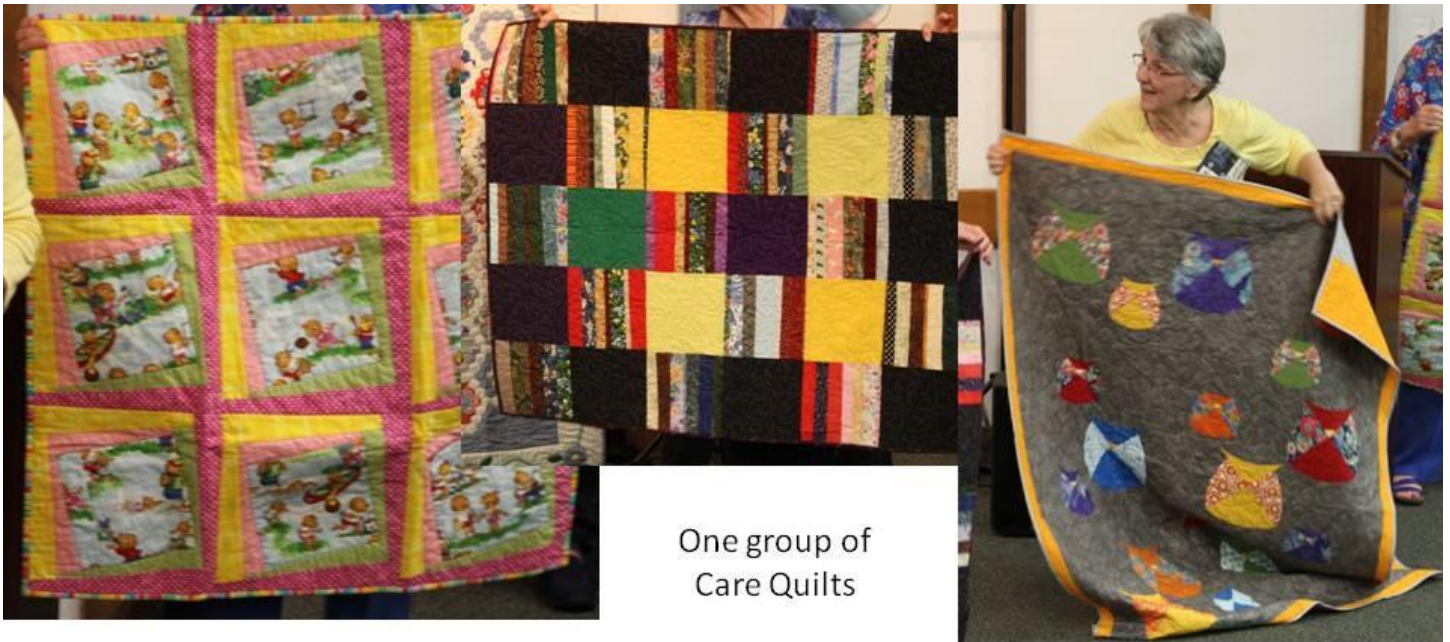
One group of Care Quilts