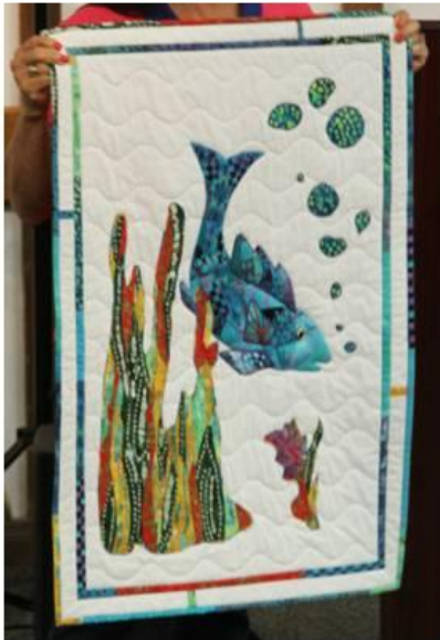
Alma's Fish Wall Hanging