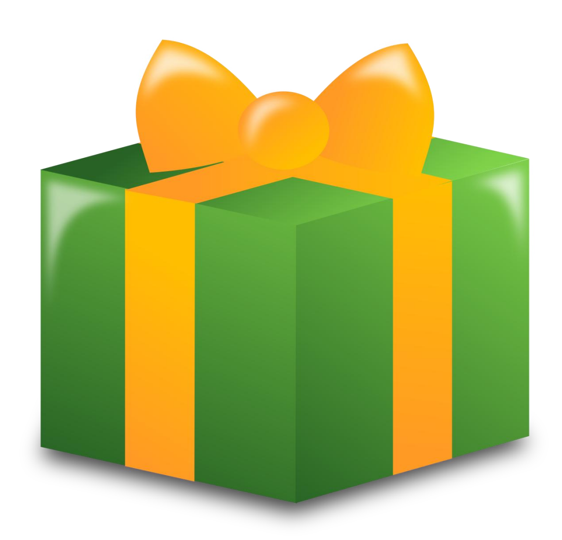
Dec 11 Christmas Party