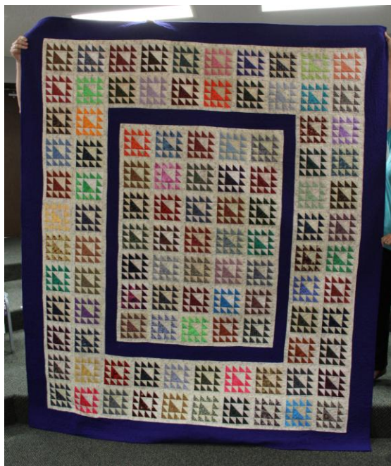
ShowNTell 7 Charmed Lady of the Lake by Sharon Braunagel