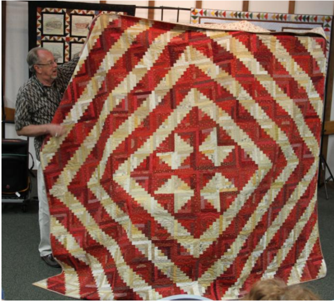
ShowNTell 8 Nicole Pavel's Log Cabin...Can you say BIG?