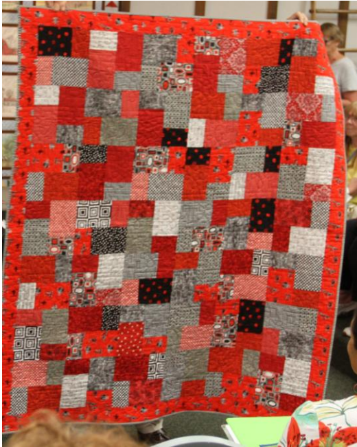
ShowNTell 10 Linda Winder – Texas Tech quilt #2