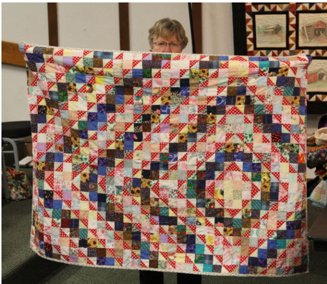
ShowNTell 5 Benita Ebel displays her Split patch quilt finally finished