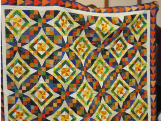
Figure 8 Nicole Pavel's Celtic Solstice quilt