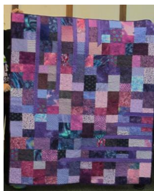
Figure 2 Carol Laughlin's Twice Sliced Purple Thing