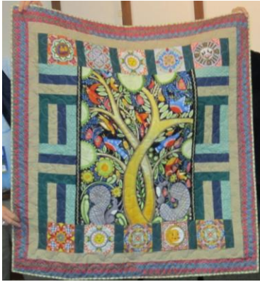
Figure 3 Charles Gilreath Books in a Blanket