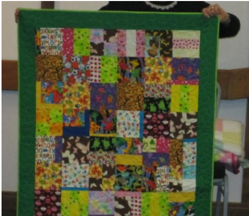
Figure 7 Care quilt from the Quilt N Piece Bee