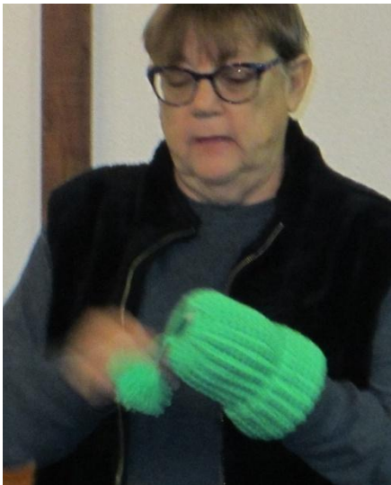
Figure 4 Kitty Ard Messy Bun Cap