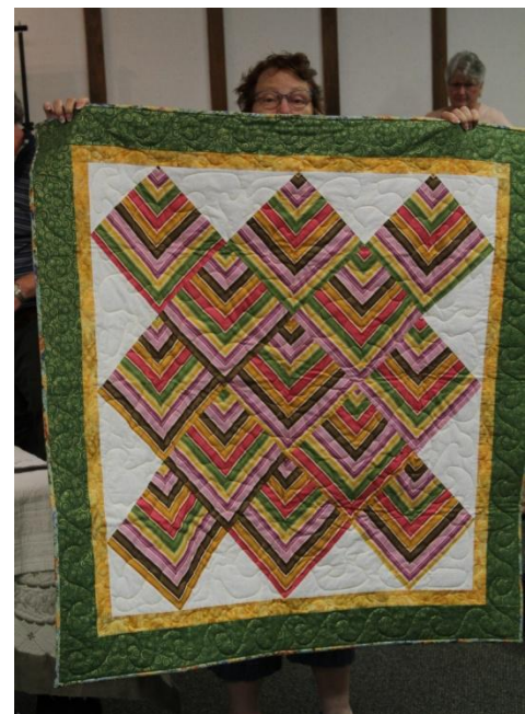
ShowNTell 1 The Latest Books and a Blanket design

While the goal was the Shipshewana Quilt Show, the Quilt Gardens and Seward Johnson art were an unexpected surprise which will call us back another year.