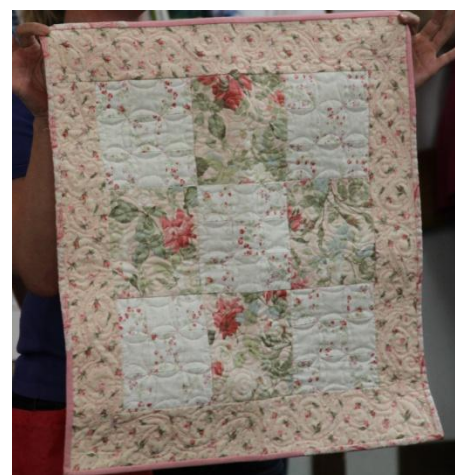
ShowNTell 5 Nicole Pavel changed to "small" this month with this cute table topper