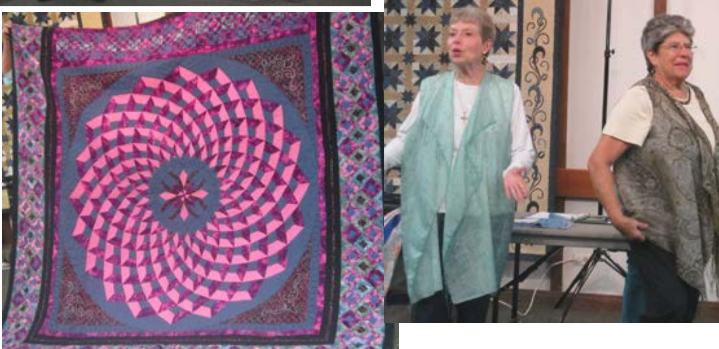
Brazos Bluebonnet Quilt Guild