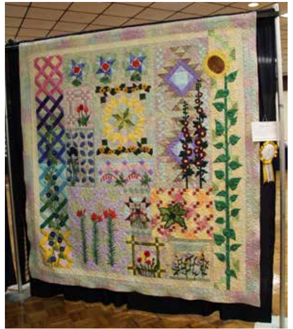
Right, Third place, Block of the Month and Kit Quilts, Kimberly DeBo- na's "Batiks in Bloom"