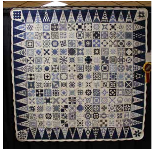
Right, Second place (tied), Mixed Technique, Michael Jackson's "My Jane"