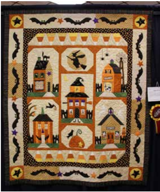
Left, Second place, Block of the Month and Kit Quilts, Lin- da Bridges' "Hal- loween Fun"