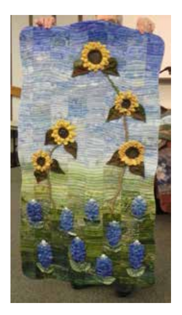
Examples of Connie's work were used to illustrate quilting aspects important to judges.

On this page, photos from Connie Silber's presentation on March 10 and a few from Show `n Tell after that program.