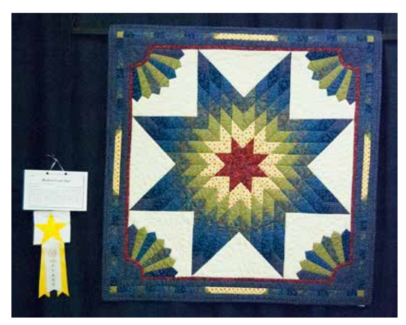
Above, the Viewers' Choice Award went to "Radiant Lone Star," which also was Third Place in Theme Quilts, shown by Lou Ellen Hassold

Once you're in the folder, click on the photo you want to download. In the bottom right-hand corner, you'll see three little dots. When you hover over those, it should say "More Actions." Click that, and the option to download the image will pop up. When you click download, you should have the option to save the photo on your computer.