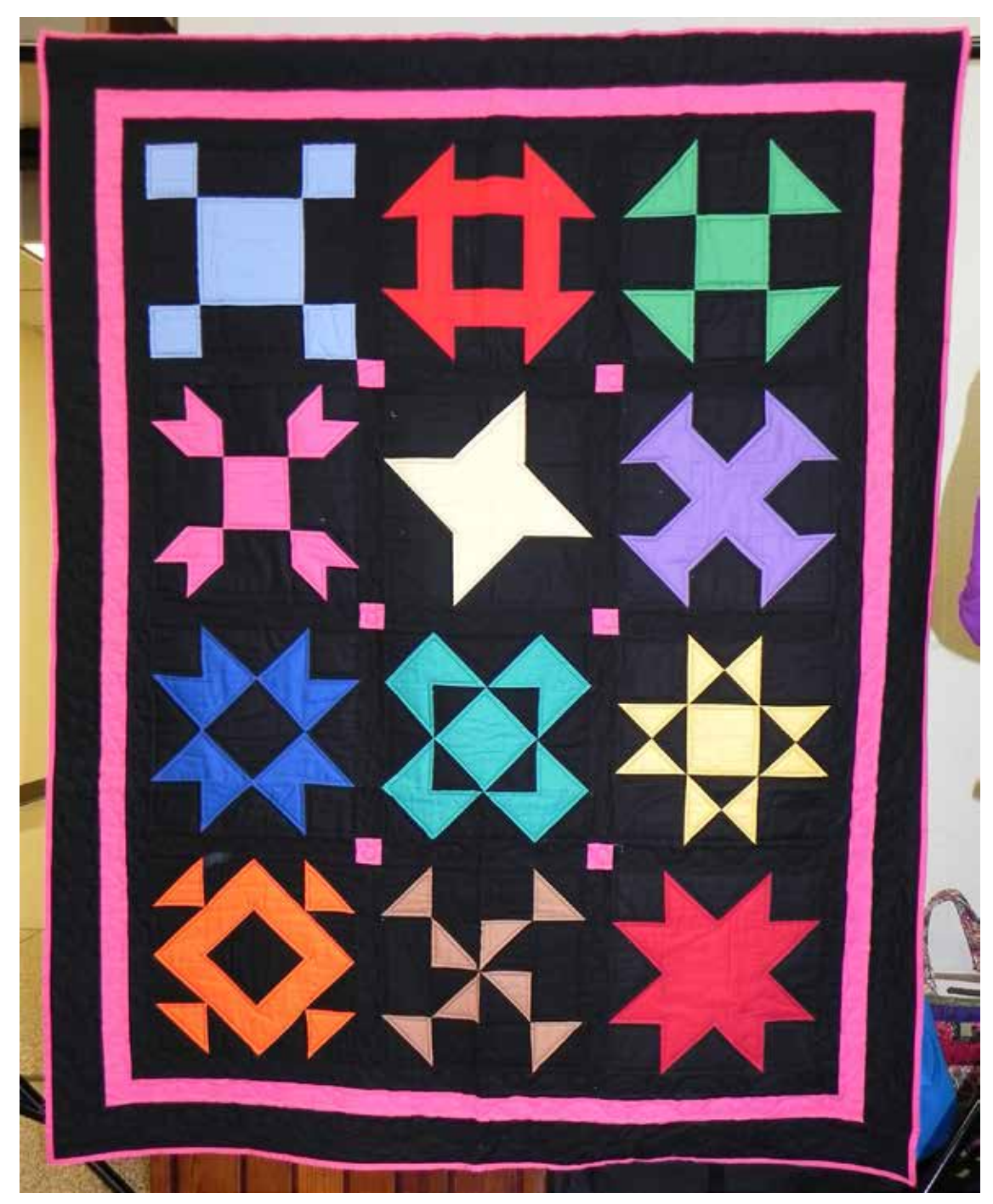
Above is the Block of the Month Quilt for this year.