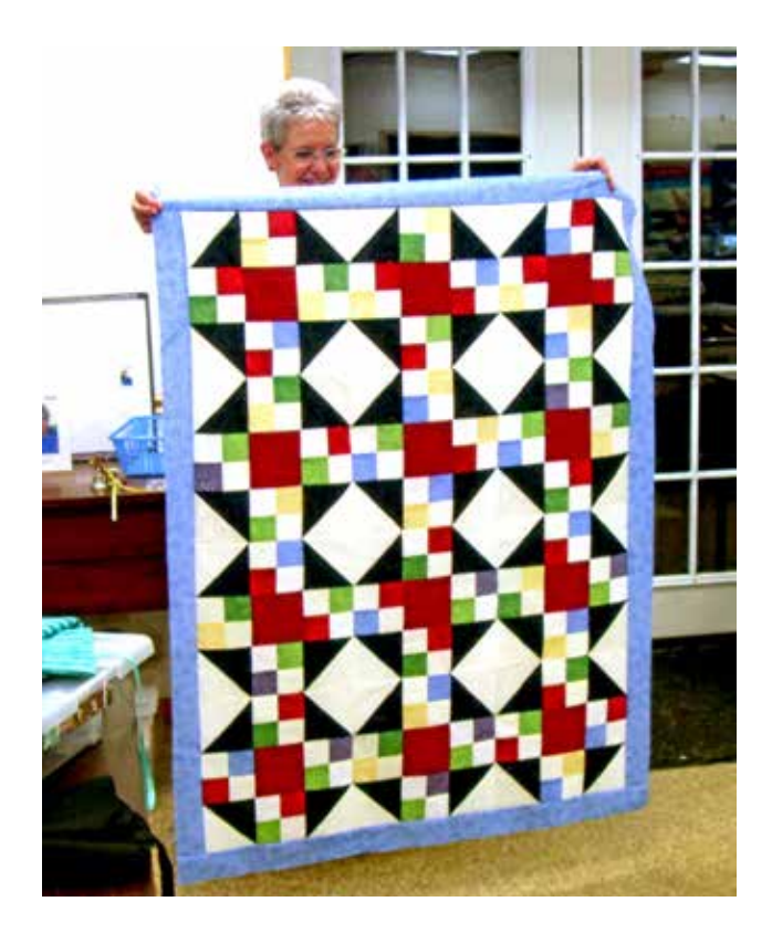
Above is the Summer Retreat's Care Quilt